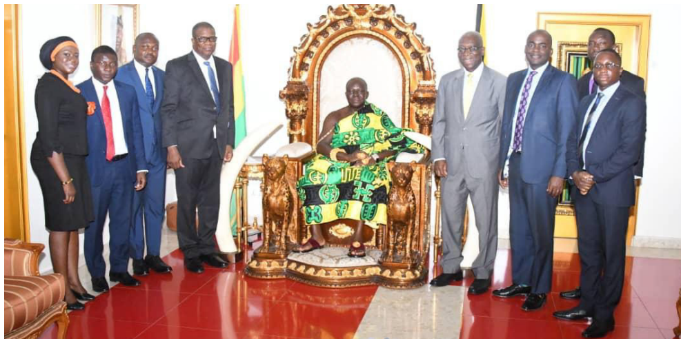
Otumfuo Osei Tutu II with the Access Bank team