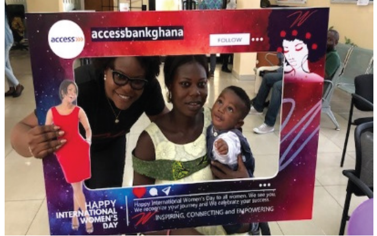
Customers pledge "Balance for Better"

The Bank marked International Women's Day celebrations from the 8th of March through to the 15th of March across forty (40) branches. As a gender sensitive Bank, the bank sought to highlight the need for equal opportunities in all areas of customers' lives while focusing on the theme #Balanceforbetter.